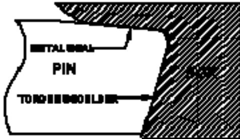
Pin lighter weight. Step on coupling shoulder.

When mixing weights that are interchangeable, there will be a step in the ID of the connection if the weights have different connection IDs . The step will be approximately equal to one-half the difference in the connection IDs. VAM TOP HC and VAM TOP HT connections have smaller IDs than standard VAM TOP connections. VAM ACE Modified connections have smaller IDs than standard VAM ACE connections.